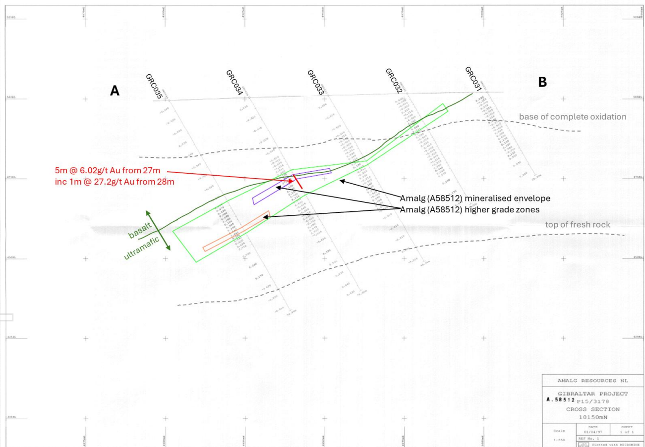
Figure 3 - Cross section A-B looking northwest. Updated cross-section 'A-B' from WAMEX Report A58512

All project proceeds will flow through a dedicated bank account, with Macro maintaining separate accounting and reporting for project activities. Renegade has full audit and information rights in respect of the mining services and project accounts.