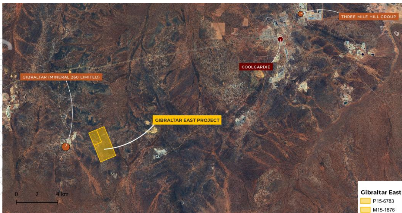
Figure 1 - Location of Gibraltar East and proximity to Gibraltar

Macro Metals Limited ( ASX:M4M ) ( Macro or the Company ) is pleased to announce that it has executed a binding mining services and profit share agreement ( Agreement ) with Renegade Metals Pty Ltd ( Renegade ) in respect of granted mining lease M15/1876 and granted prospecting licence P15/6783 ( Tenements ), which together comprise the Gibraltar East Gold Project ( Project ) in the Coolgardie Mineral Field, Western Australia.