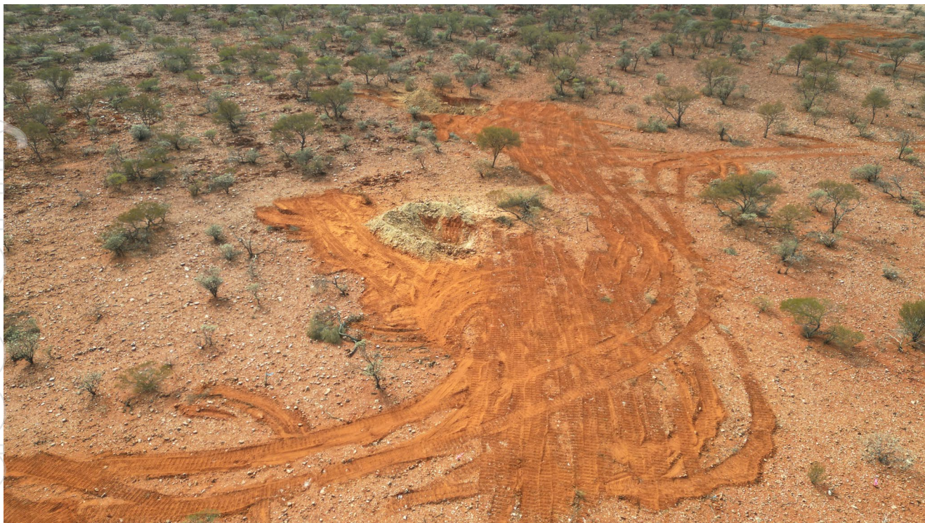
Figure 1: Site works completed at the Rochefort Prospect