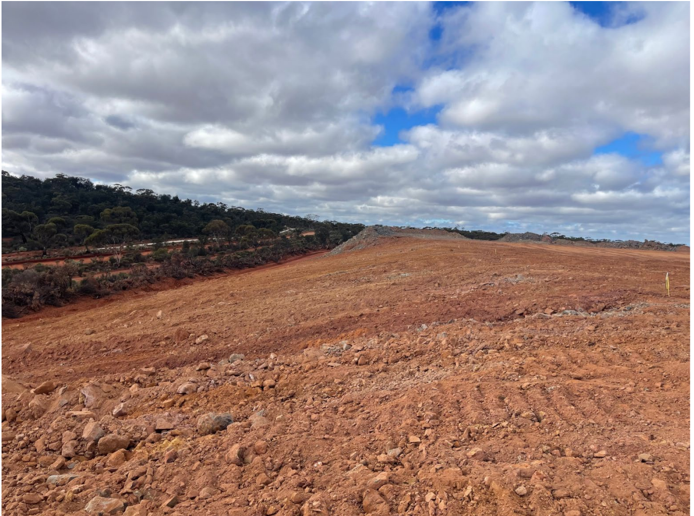
Figure 2: Rehabilitation of the waste dumps is underway and runs in parallel to the mining operations.