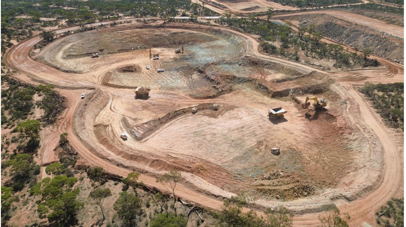
Figure 1: End of April 2026 - drilling & blasting was completed for the 305mRL bench and commenced on the 300mRL bench.