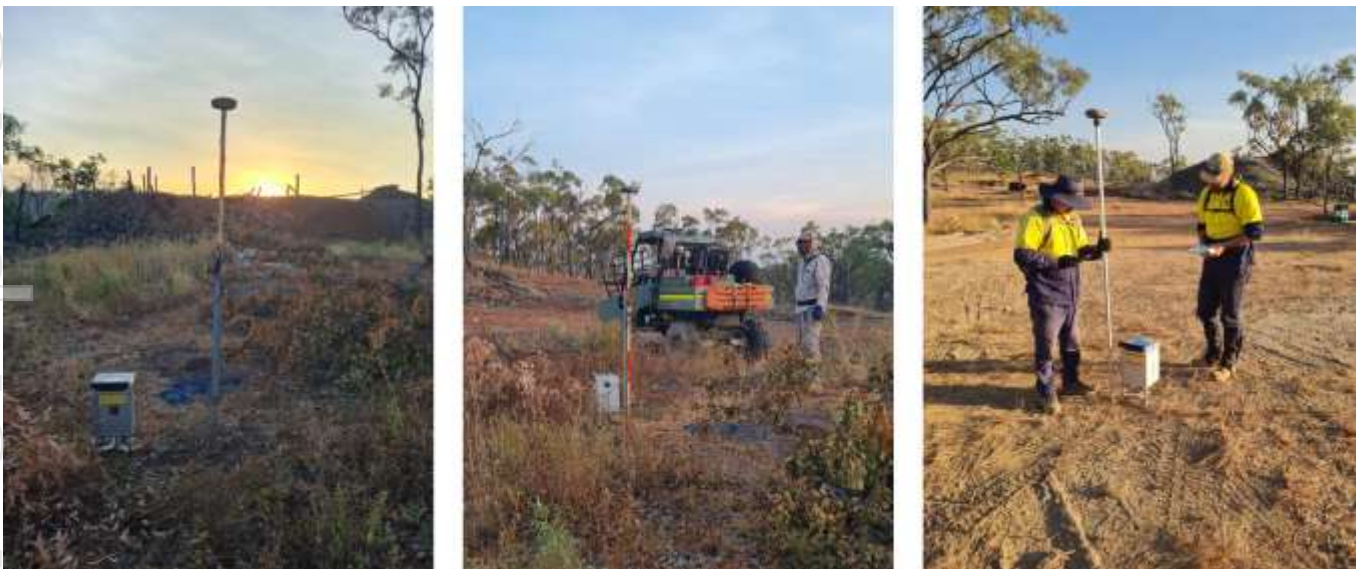
Figure 2 – Gravity survey underway around the Torpy's prospect.