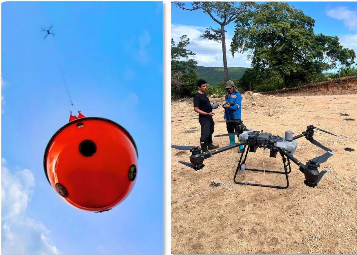
Figure 1. UAV sling mounted MobileMTd Sensor and FlyCart30 heavy-lift Quadcopter

The survey follows the successful completion of Estrella's Category B market appraisal extraction programme, which delivered a surveyed Stage 1 stockpile of approximately 27,371 tonnes of manganese ore at a weighted average grade of 28.64% Mn. Mining activities confirmed structurally complex, high-grade manganese mineralisation extending to the pit floor and walls, with in-situ grades reaching up to 60.22% Mn 1 .