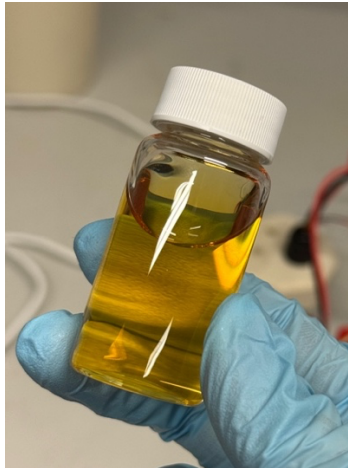
Energy Ink™ under development