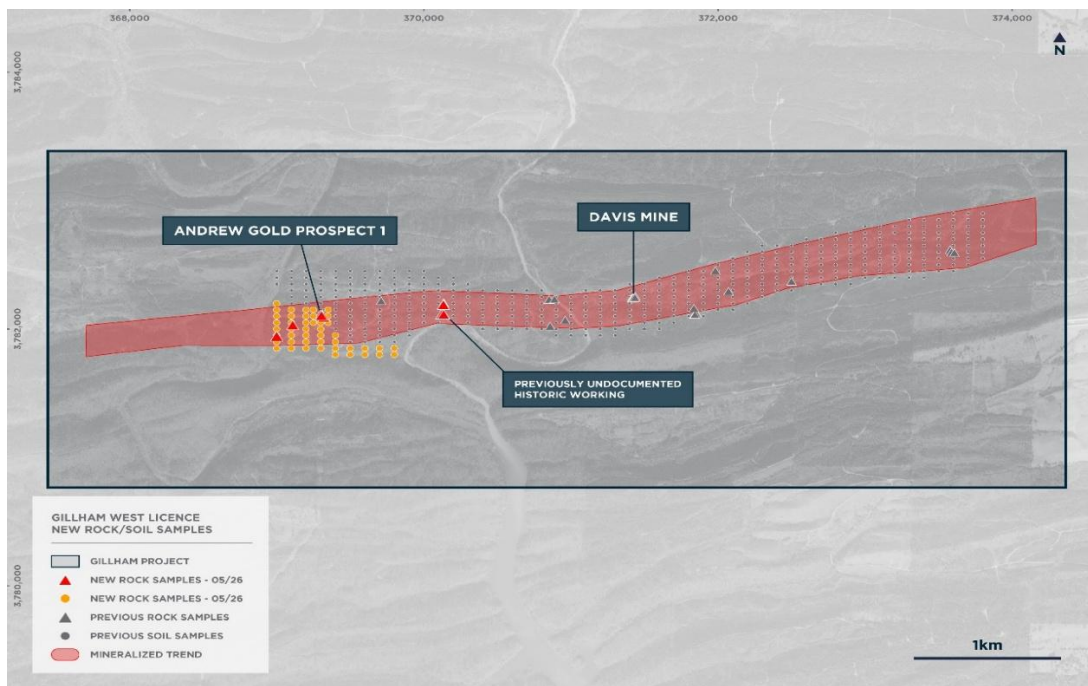
Figure 1 – Gillham West Licence - New Rock and Soil samples

Geological observations across multiple historic workings continue to be highly encouraging as we complete the final surface exploration phase before drilling. Results from both programs will be central to refining priority targets and advancing Gillham as a strategically important U.S. based critical minerals project.”