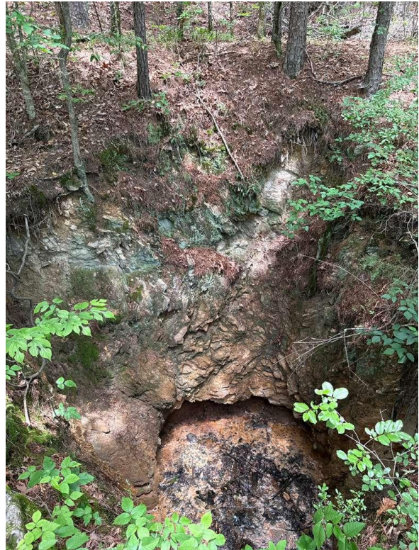
Figure 3 - Historic mine workings from the May Prospect