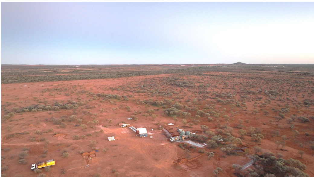
Figure 3. RC drilling May 2026 at McNabs East Main Zone with the town of Mount Magnet in the background.