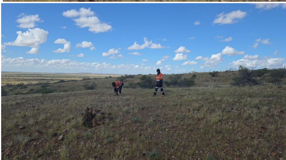
Images 2&3: Members of the Dieri arriving and conducting heritage clearance at South Ridge