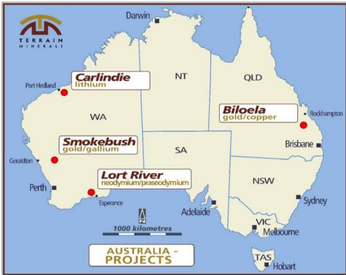
Diagram 2. Project location map.