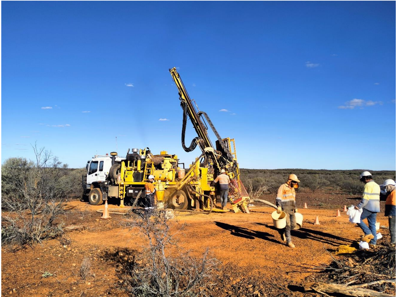
Figure 2. Weebo Project – Air Core drilling commenced

late 2025 by Magmatic will be tested down dip to test bedrock mineralisation. This phase of AC drilling aims to better define mineralised structures that may be tested by RC drilling.