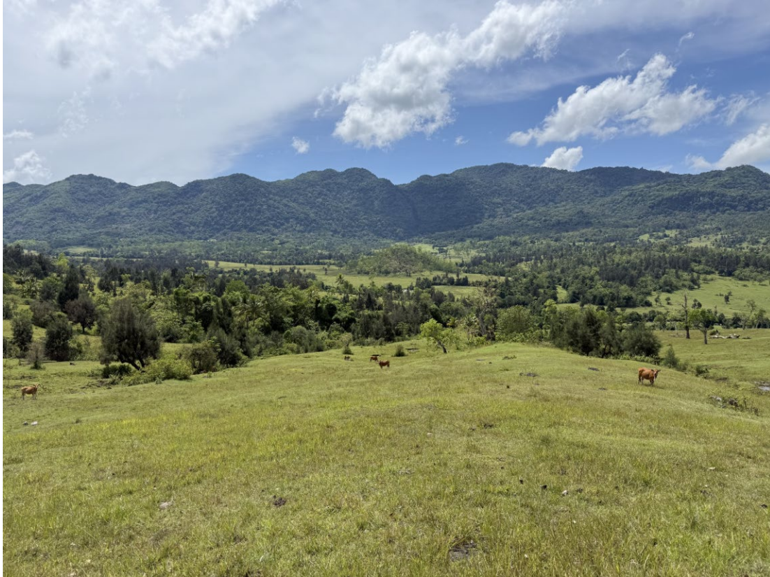
Figure 3: Terrain at the Nakroma Prospect at the Ossu Project

Tivan continues to maintain productive and constructive engagement with Timor-Leste's National Mining Authority (ANM) as the Company advances toward a maiden drilling program. The regulatory pathway to advance to drilling is well understood and is expected to principally involve the expansion and amendment of existing Environmental Management Plans (EMPs) to incorporate ground-disturbing activities, together with approval of the work program and stakeholder engagement processes under the Timor-Leste Mining Code.