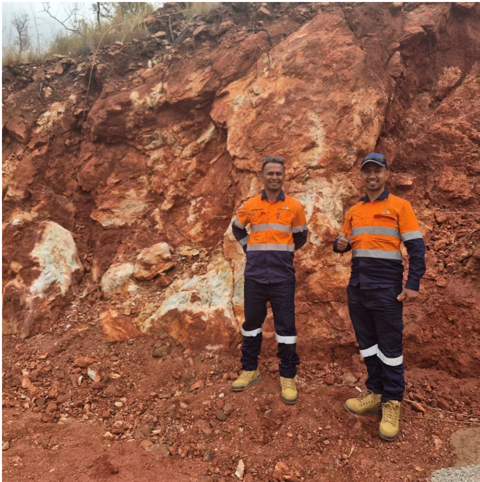
Figure 2: Murak Rai representatives at the Speewah Fluorite Project in May 2026

As part of early collaborative efforts, geologists from Murak Rai are attending Tivan's fieldworks including drilling at the Speewah Fluorite Project in Western Australia in the fortnight ahead. This joint initiative is part of ongoing capability building and workforce training to support the development of the Timor-Leste mineral resources sector.