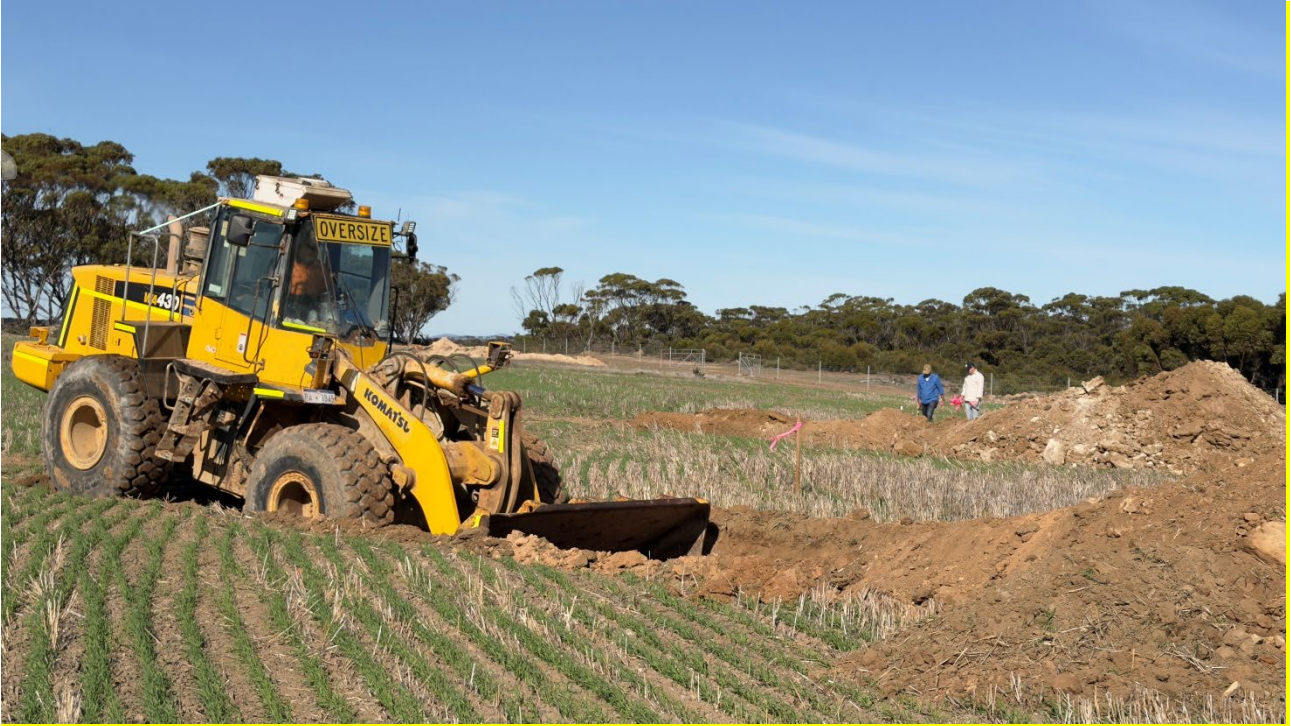
Figure 1: Site works underway at Maori Queen.

The approved program has been designed to systematically test four prospects across the Mt Cattlin Gold Project: Sirdar, Maori Queen, Ellendale and Plantagenet. The program targets shallow extensions to the high-grade Sirdar and Maori Queen deposits — both of which carry exceptional historical grades — and provides the first modern systematic RC drill-testing of the Ellendale and Plantagenet prospects.