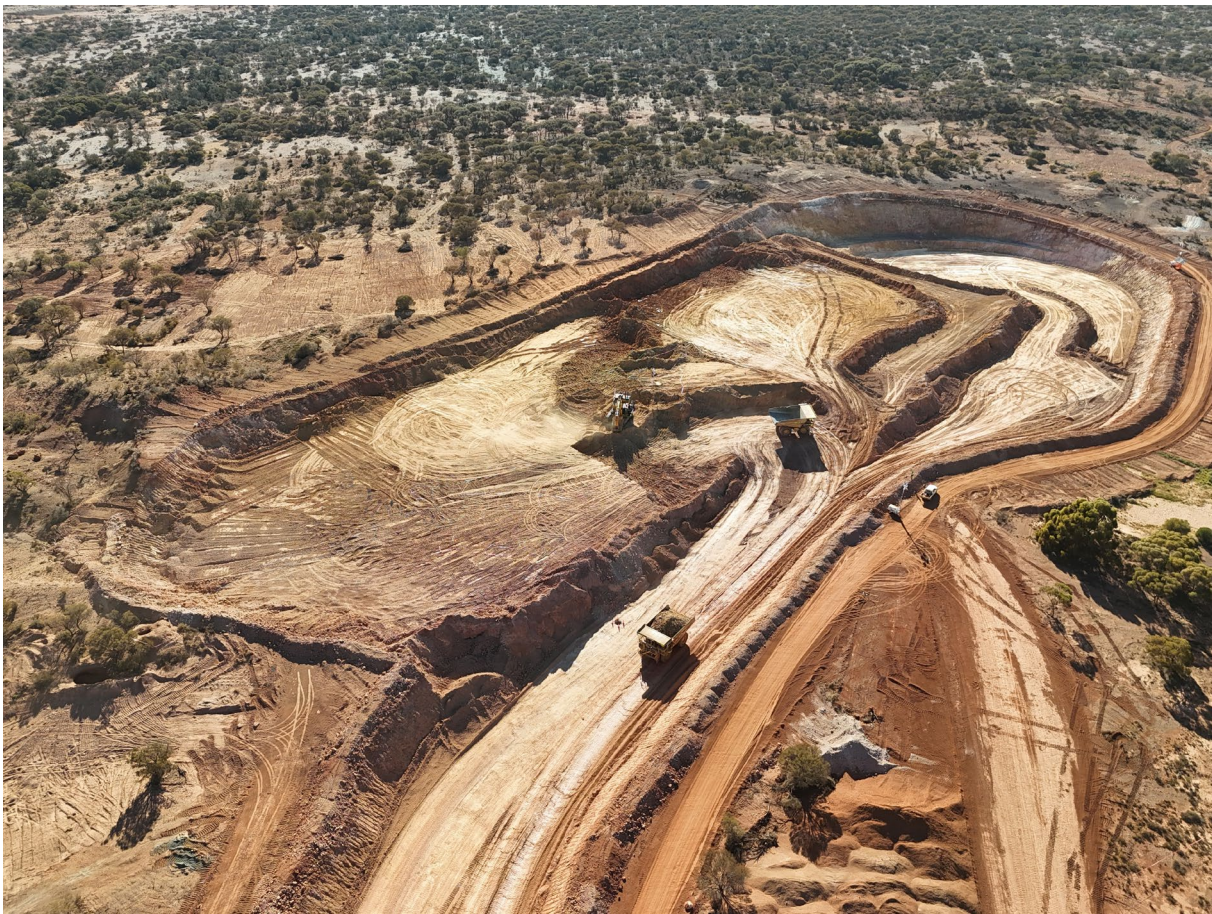
Figure 1. Mining operations underway at the Redcastle Reef open pit within granted Mining Lease M39/318