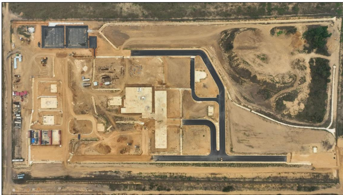
Figure 2 – Cabinda Phosphate Fertilizer Project, located in Cabinda Angola, with Phase 1 construction works now completed.

Minbos considers the completion of the IDC security arrangements and submission of the first drawdown request to be a major step towards the recommencement of construction activities and the delivery of the Cabinda Phosphate Fertilizer Project.