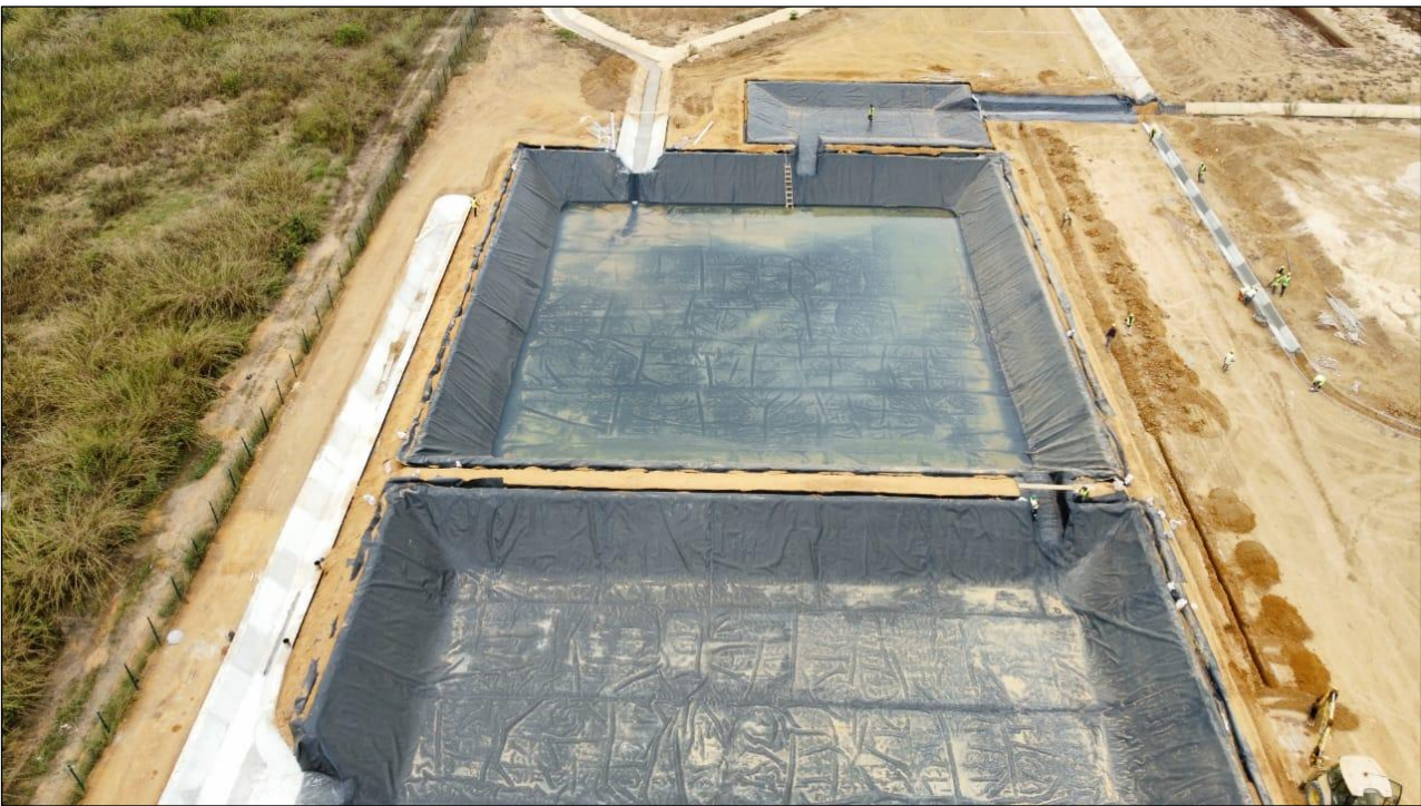
Figure 4 - Cabinda Phosphate Fertilizer Project, water run-off settling ponds.