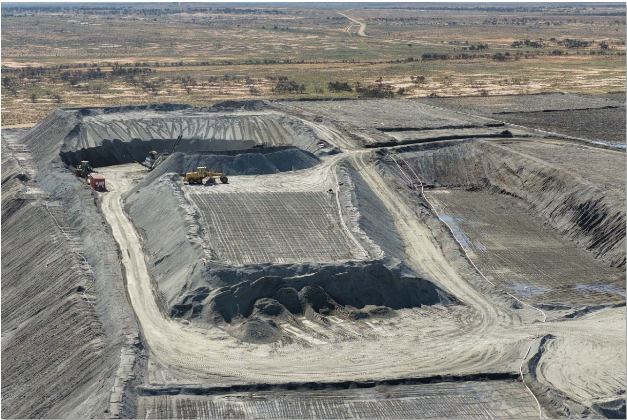
Photo 1: Photo looking north of heap leach irrigation of new re-crush material at White Dam Gold Project SA.

"Alongside this operational success, the key to building this business is drilling and expanding the known resources we have at White Dam and on our exploration assets nearby. I am very happy to see drilling now recommenced at our shallow high priority targets as diesel prices have stabilised and we can get on with our growth strategy for the company."