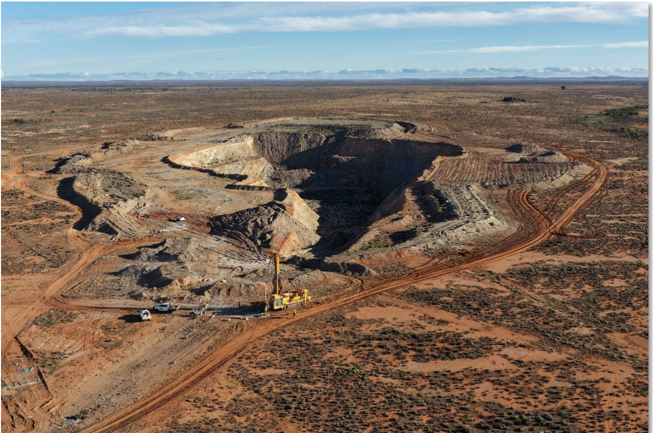
Photo 2: Photo of the RC drill rig operating at the Vertigo deposit, White Dam Gold Project, SA.