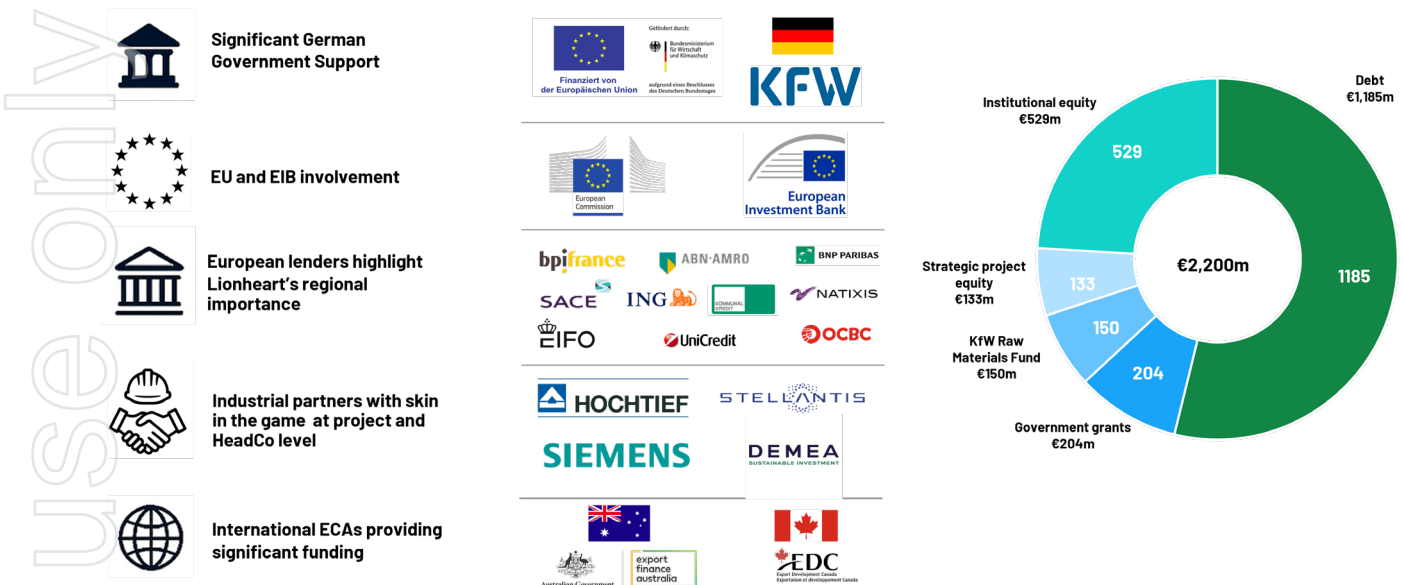
Figure 2: Image showing the combination of arrangements comprising the financing package at the project, subsidiary and head Company level.