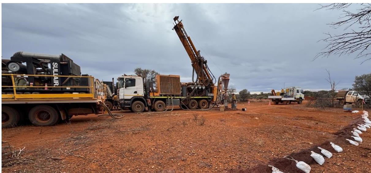
Figure 1. Weebo Project – RC drilling commenced