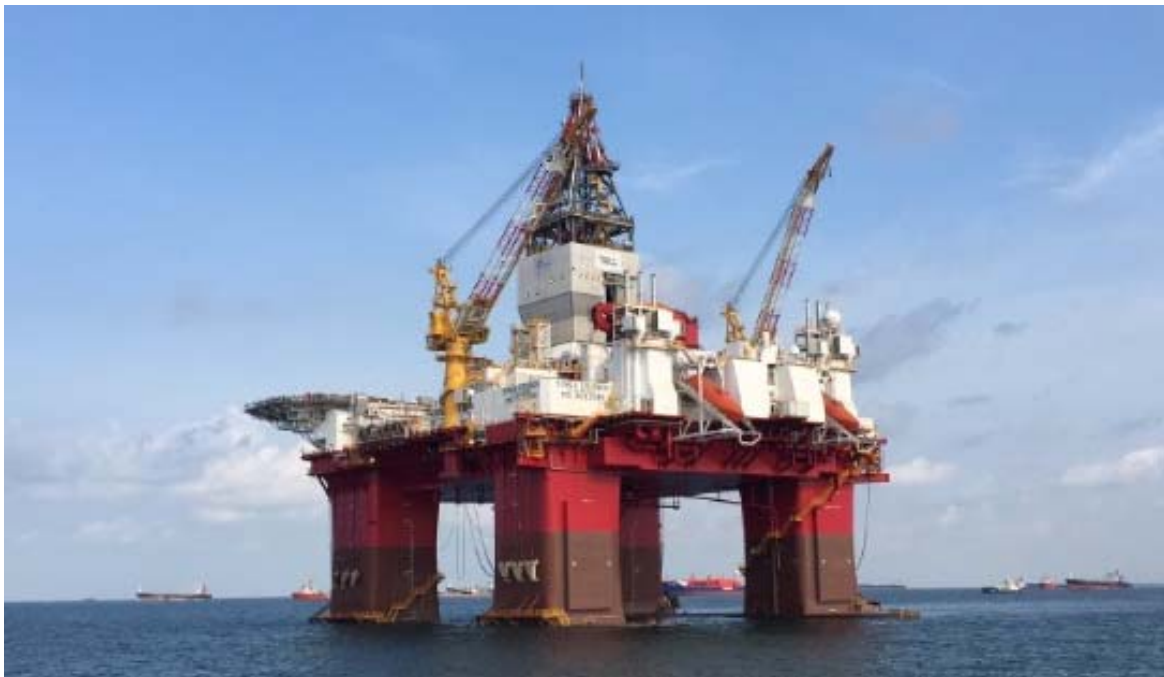
Photo 1: Transocean Equinox Semi-Submersible Mobile Offshore Drilling Unit

Carnarvon Energy Limited (ASX: CVN) (" Carnarvon " or " the Company ") is pleased to announce the Transocean Equinox semi-submersible mobile offshore drilling unit has been contracted as part of a multi-well drilling campaign which includes wells in Carnarvon's Bedout Sub-basin exploration permits.