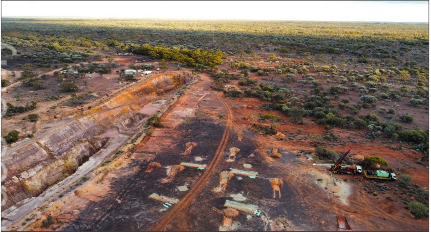
Figure 1: Zelica Gold Project site, WA