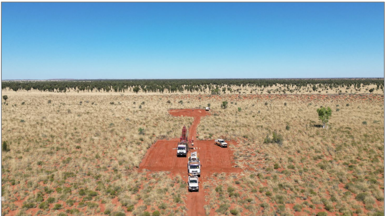
Figure 1. Aircore drilling at Lonar East, West Arunta Project

Tali Resources Ltd (ASX: TR2) ( Tali or the Company ) is pleased to advise that its aircore drill program has commenced at the West Arunta Project.