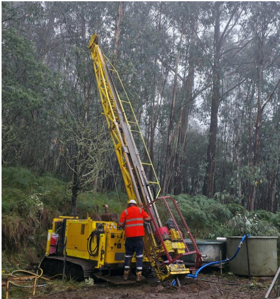
Figure 1: Cortech Rig drilling 25SSDH001