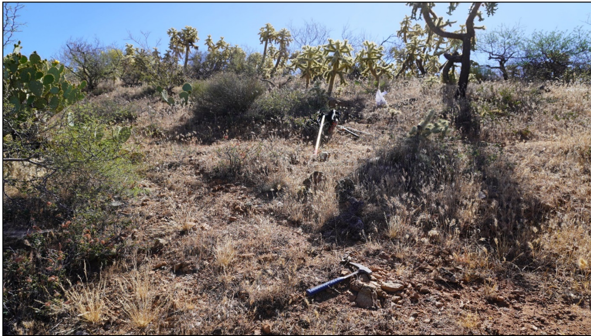
Figure 1: Typical terrain Line 2