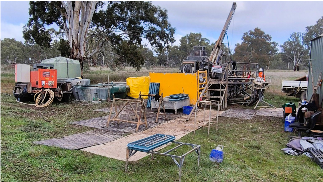
Drill rig drilling east from the west end of the West Pit (3 June 2026)

Nagambie Resources Limited ('Nagambie' or the 'Company', ASX: NAG) is pleased to announce that Mandalay Resources Costerfield Operations Pty Ltd, a wholly-owned subsidiary of Alkane Resources Ltd (ASX: ALK, TSX:ALK) ( Alkane ) has commenced diamond drilling of the Antimony-Gold Project discovery at the Nagambie Mine.