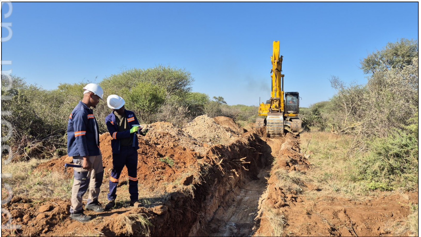
Figure 2: Blaze geologists inspecting the first trench at the Krokodil Prospect.

The samples will then be crushed and analysed with a handheld XRF. If the samples report anomalous XRF results, they will be sent to a laboratory in South Africa for full multi-element analysis. Samples which do not report anomalous values will be kept in storage.