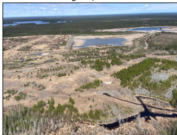
Figure 5 – Golden Patricia rehabilitated mining operations looking north, May 2026