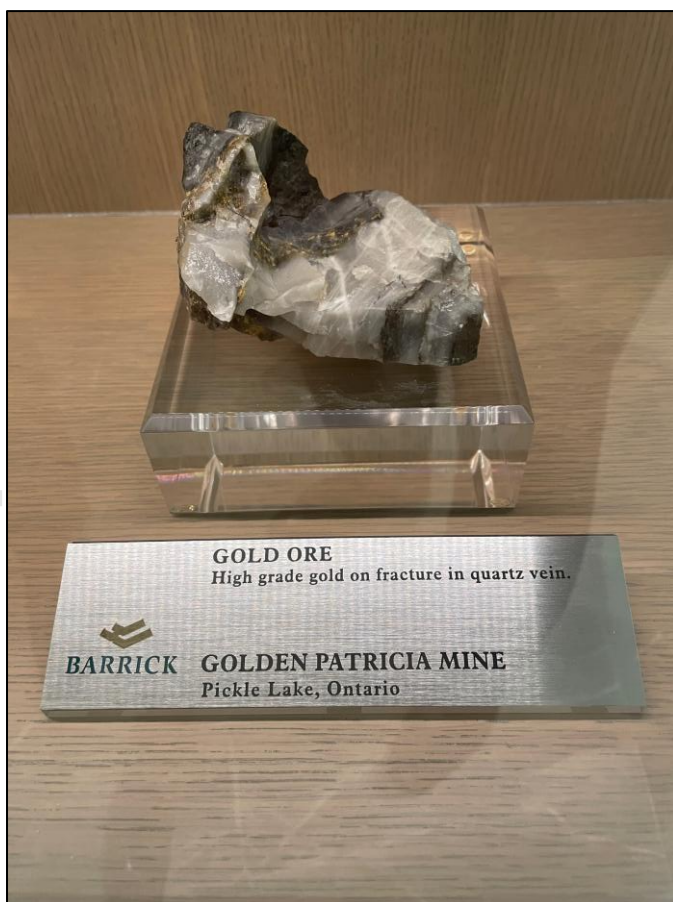
Figure 3 – Historical Golden Patricia specimen on display in Barrick’s corporate office, Toronto