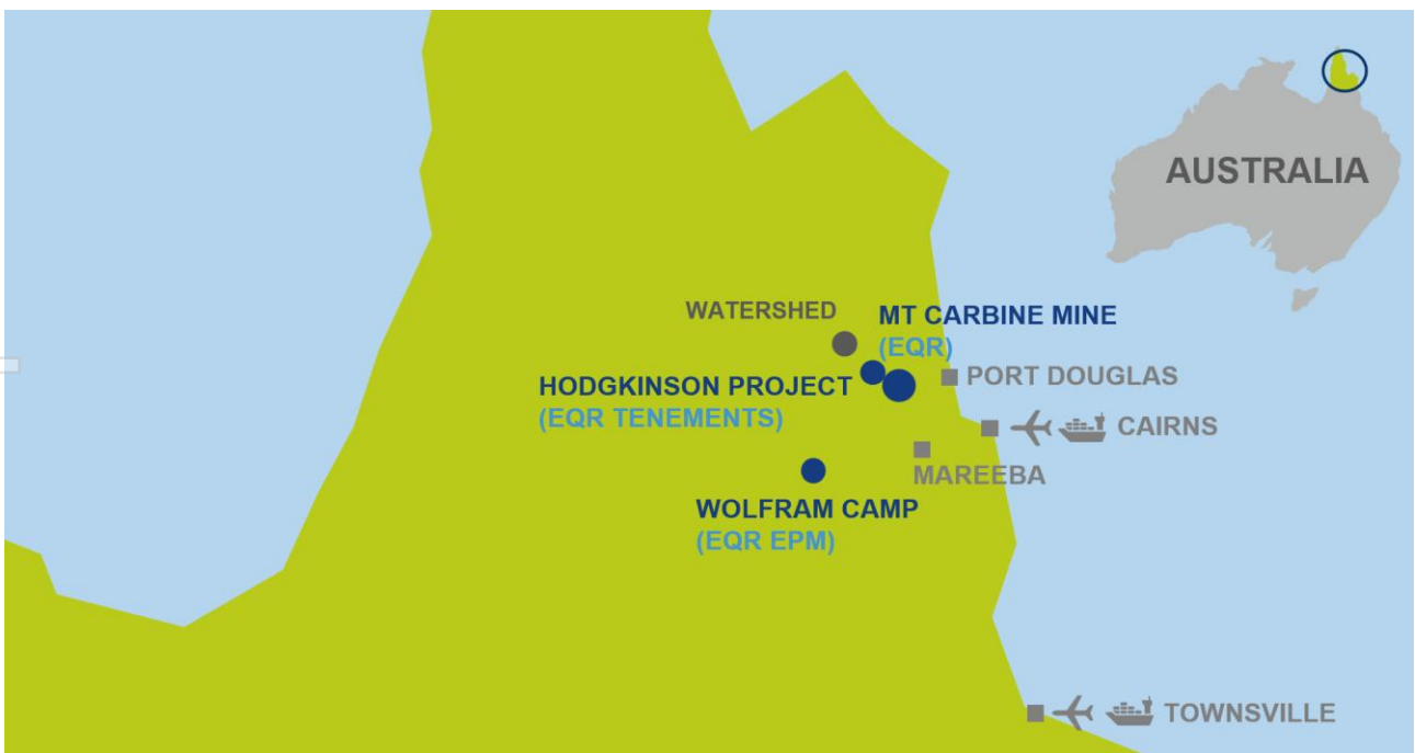
Figure 2: Hodgkinson Project Proximity to Mt Carbine