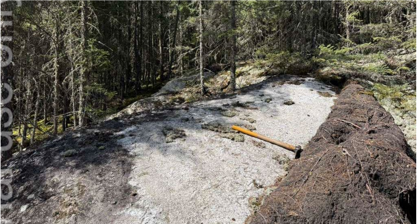
Figure 1 – Newly identified concealed pegmatite at the Corona target area.

completed systematic prospecting, geological mapping, and structural data collection, returning 106 rock samples, 161 outcrop maps, and 74 structural measurements. A total of 14 pegmatite bodies were identified and sampled — including 6 newly mapped — confirming a broader pegmatite system across the northern corridor than previously recognised.