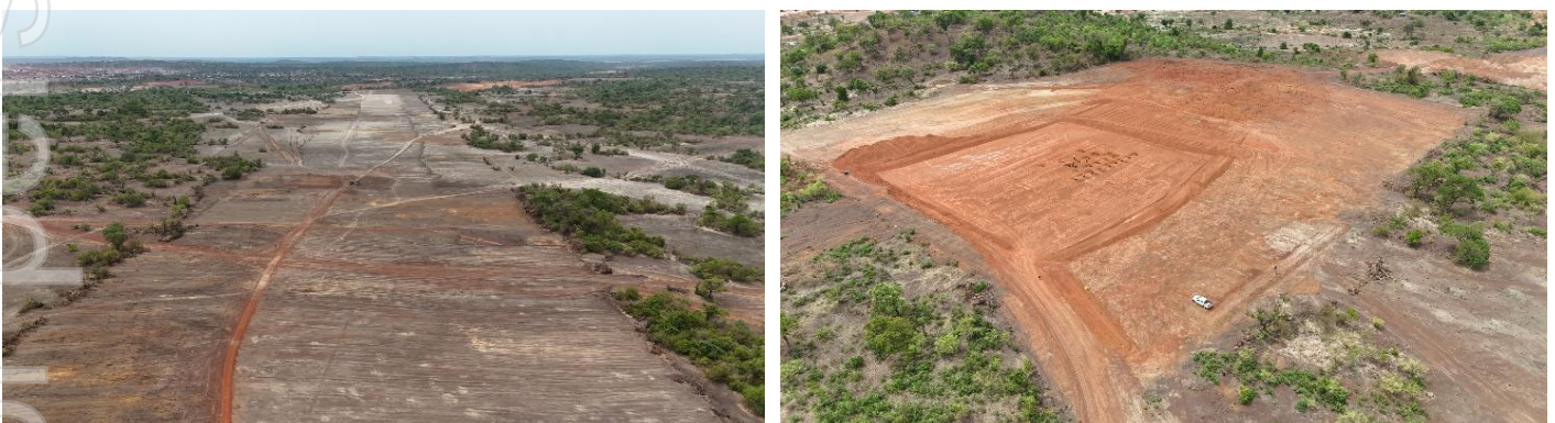
Photos 5 & 6: Cleared Area for the Airstrip (LHS) and Operations Camp Site (RHS)

At Kobada, bulk earthworks are progressing rapidly with the process plant site now cleared and levelled (Photo 1). The water storage dam and turkey's nest are on track to be completed in the coming weeks (Photos 2 - 4), ahead of the commencement of the wet season. Clearing of the airstrip and permanent camp areas commenced last month, with construction of the airstrip (Photo 5) and tailings storage facilities as the next priorities for earthworks. Upgrades to the existing accommodation facilities at Kobada have largely been completed enabling these to be used as the construction camp.