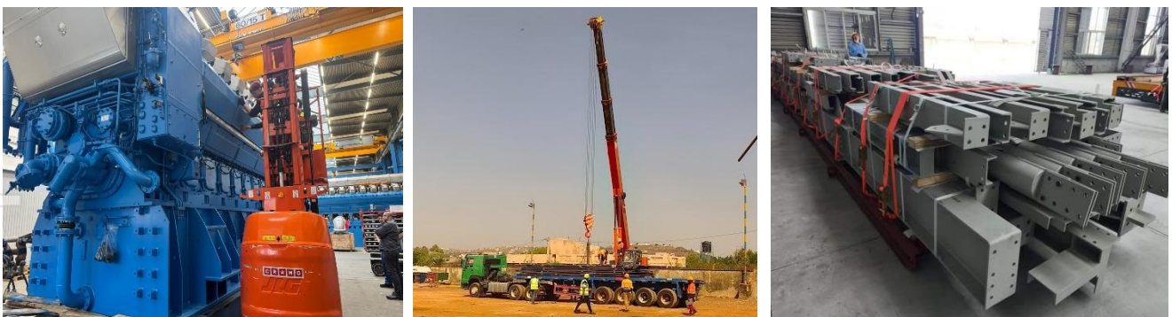
Photos 9, 10 & 11: Power Units Final Inspection (LHS), CIL Plates Being Unloaded in Bamako (center) and Structural Steel Ready for Shipping (RHS)

Toubani is targeting first gold production in the third quarter of calendar year 2027 and remains on schedule to achieve this target.