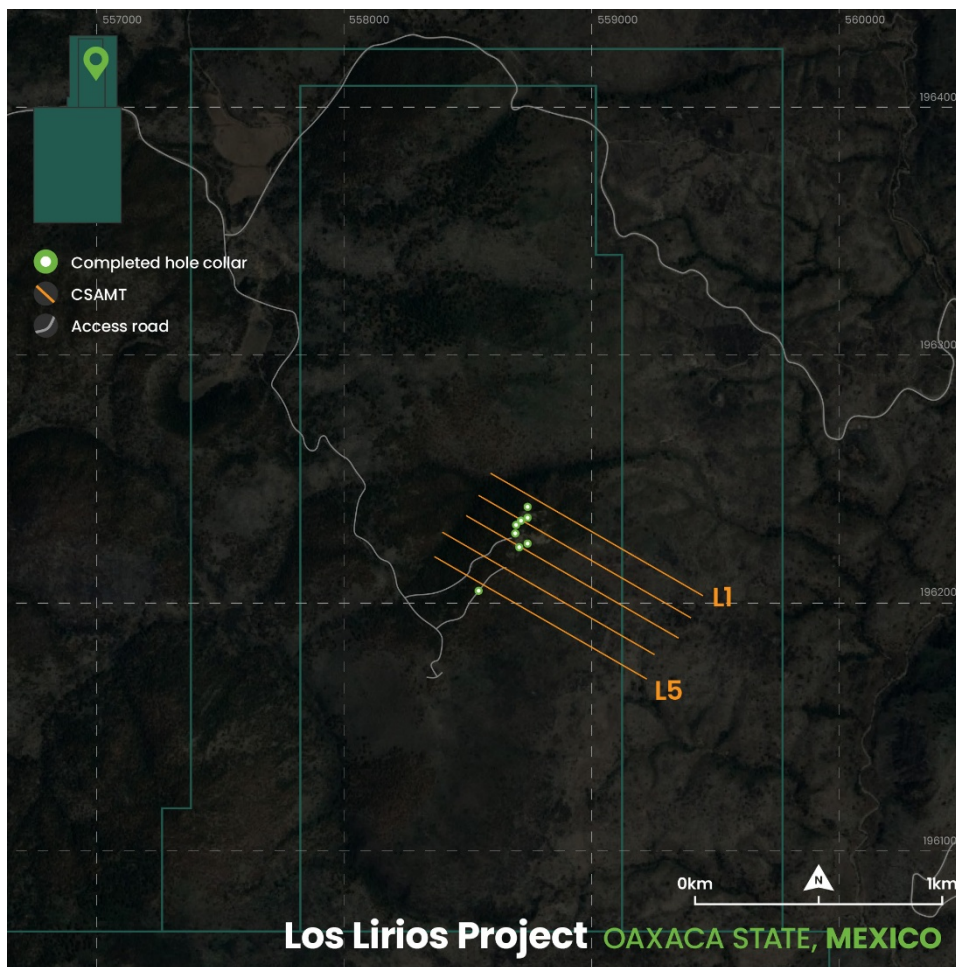
Figure 3: Location of Lirios 1 CSAMT survey and Phase 1 drill collars