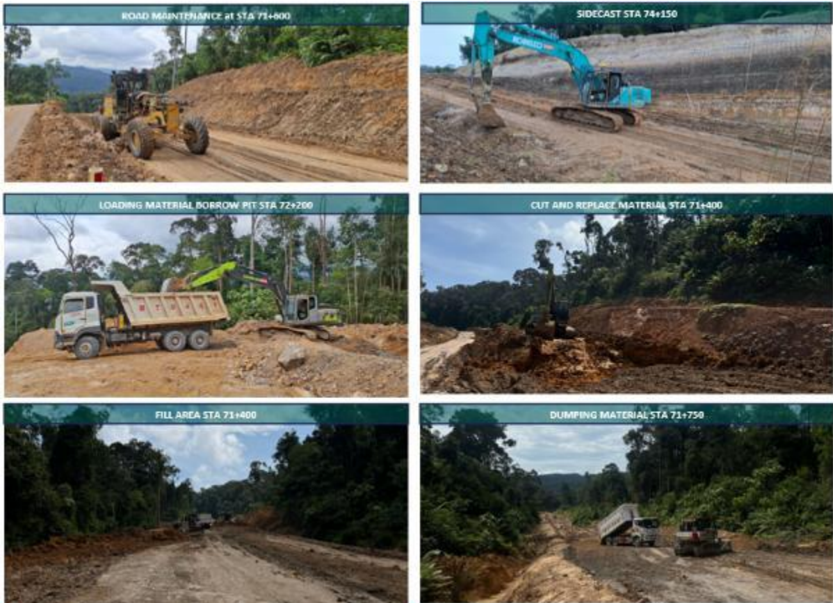
Segment B2 (STA 85+875 – STA 69+775) progress