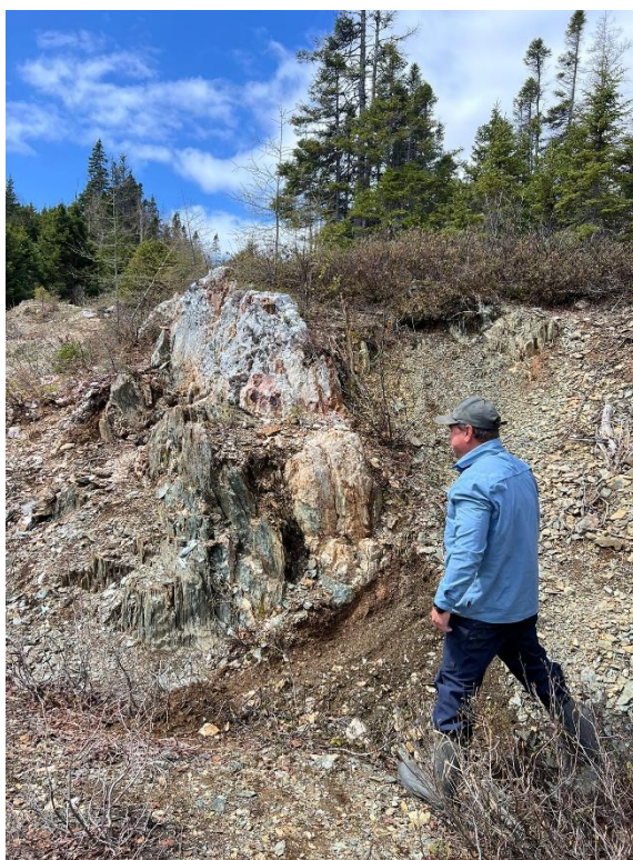
Figure 1 – Photograph of the outcropping Jackpot Prospect quartz vein and sub-vertical shear zone at the Company’s Mountain Pond Gold Project in Newfoundland, Canada. Reward management conducted a recent site visit to the prospect including prospective areas along strike to conduct confirmation and verification sampling to support future drill program design.

“The more advanced Jackpot Prospect is largely drill-ready, pending our verification sampling, minor access track clearing, final drill hole design, and statutory approvals, which we expect to be straightforward.”