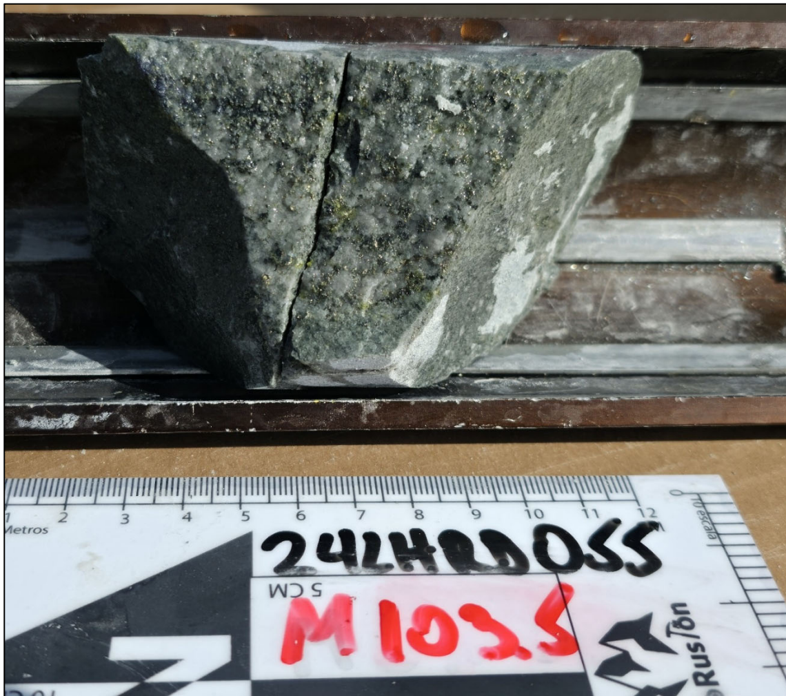
Figure 2: Typical disseminated chalcopyrite from 103.5m downhole in 24LHRD055* (refer to Appendix 1).

* Cautionary Statement: Visual estimates of mineral abundance should never be considered a proxy or substitute for laboratory analysis where concentrations or grades are the factor of principal economic interest. Visual estimates may also provide no information about impurities or deleterious physical properties relevant to valuations.