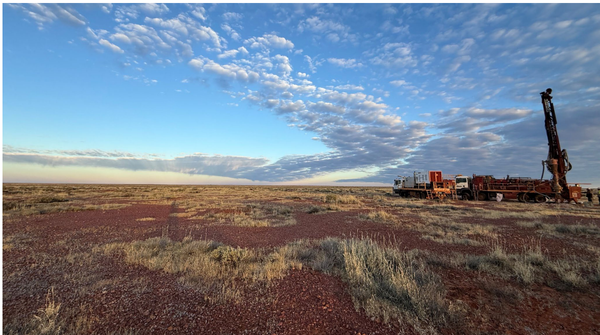
Figure 3: Reverse Circulation (RC) drilling rig on site at Coober Pedy drilling the priority IOCG targets.