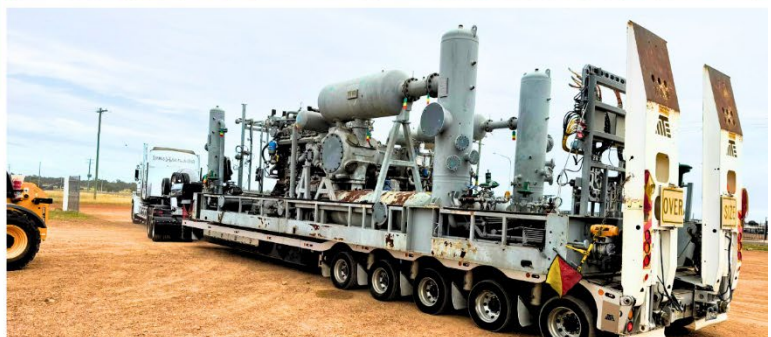
Carpentaria Gas Plant site installation