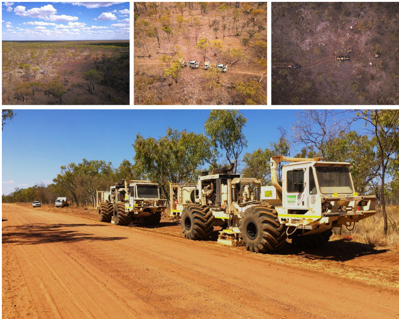
Seismic survey at Carpentaria EP187 in 2019 (Illustrative of the upcoming program)

The program is designed to delineate a >20 TCF resource and build a multi-decade LNG scale drilling inventory strategically located near pipeline, road and rail infrastructure.