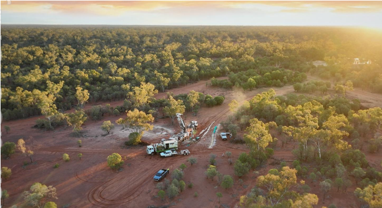
Figure 1 - Drilling Commenced at the Byrock Project, NSW; UDR1000 drill rig pictured - Resolution Drilling (NSW)