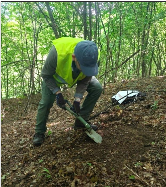
Figure 1: Soil sampling at Srebrenica North

Regener8 Resources NL (ASX: R8R) (Regener8 or the Company) is pleased to advise the completion of field works for Phase 1 soil sampling on the Srebrenica North project (Project), following the recently completed acquisition of Orichalcum d.o.o. in Bosnia and Herzegovina.