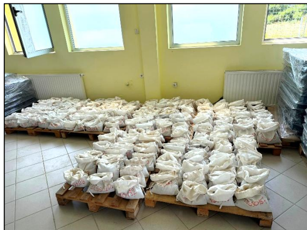
Figure 2: Samples drying prior to dispatch to laboratory