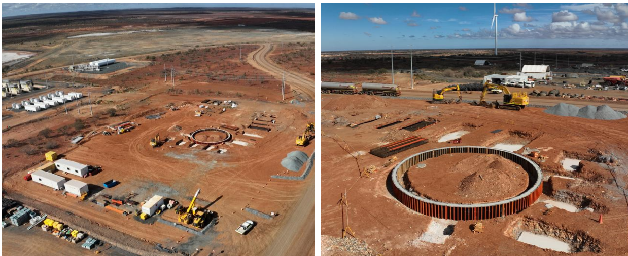
Figure 2: Paste Plant foundations and base of the tailings holding tank.

Construction of the paste plant has commenced and is on schedule for commissioning in the March 2027 quarter. GR Engineering Limited is on site with initial foundations and the base of the 2,000m 3 tailings holding tank now in place (Figure 2).