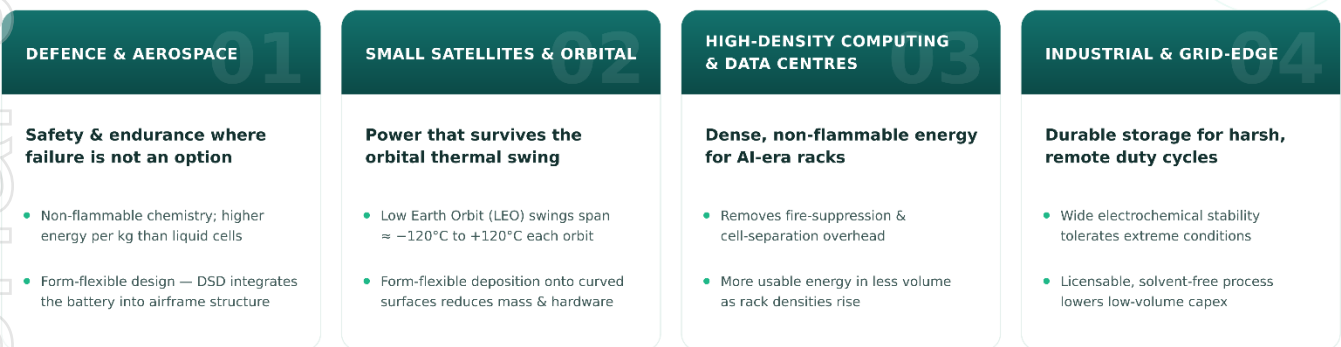
Figure 3: Potential target applications of solid-state battery technology. The attributes CRR's program is validating — high energy density, non-flammable electrolyte, wide temperature range, and form-flexible deposition — address the core constraints that limit conventional lithium-ion in each of these environments.

The attributes CRR's program is validating address constraints that limit conventional lithium-ion where it is pushed hardest.