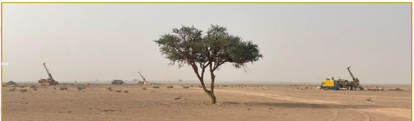
Photo of drill rigs (3) testing targets within the As Safra SE Cu-Au Zone.

Assays from the current drilling program are pending and expected in the coming weeks. SNX geologists are encouraged by geological observations from drilling completed to date, with mineralisation observed in both oxide and fresh rock, in line with the Company's expectations.