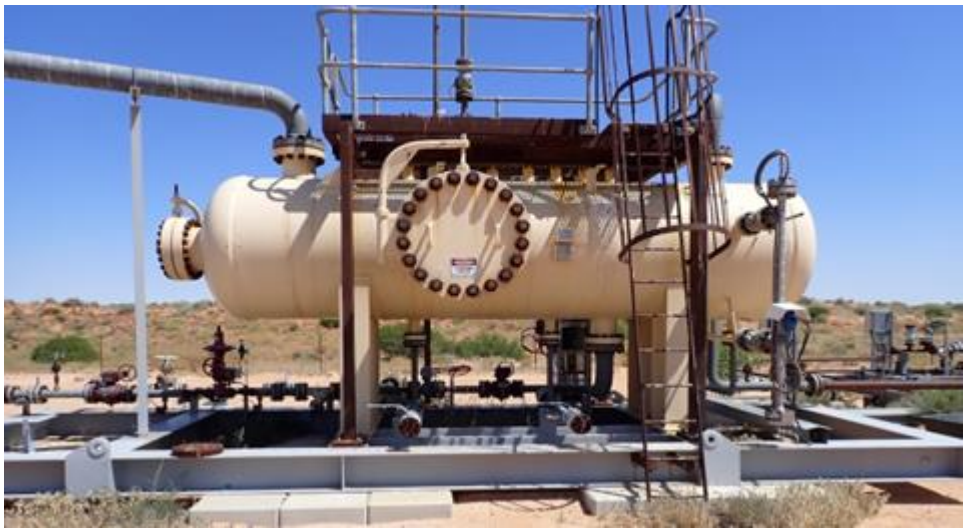
Figure 2: Gas/liquids separator in place at Vanessa facility

Further detail on the Vanessa gas field potential and its role in commercialising the much larger gas resource contained in PEL 182 is summarised in the investor presentation released to the ASX on 10 September 2025.