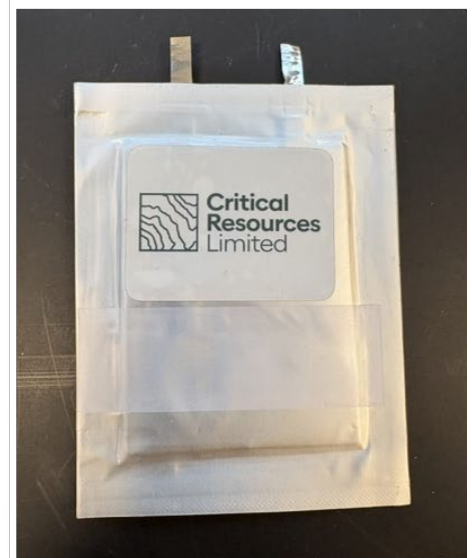
Figure 1 – Left: initial conditioning (formation) cycle for DSD pouch cell, C-rate 0.05C. Right: full-format pouch cell built with the DSD-deposited cathode composite on a liquid-electrolyte baseline.