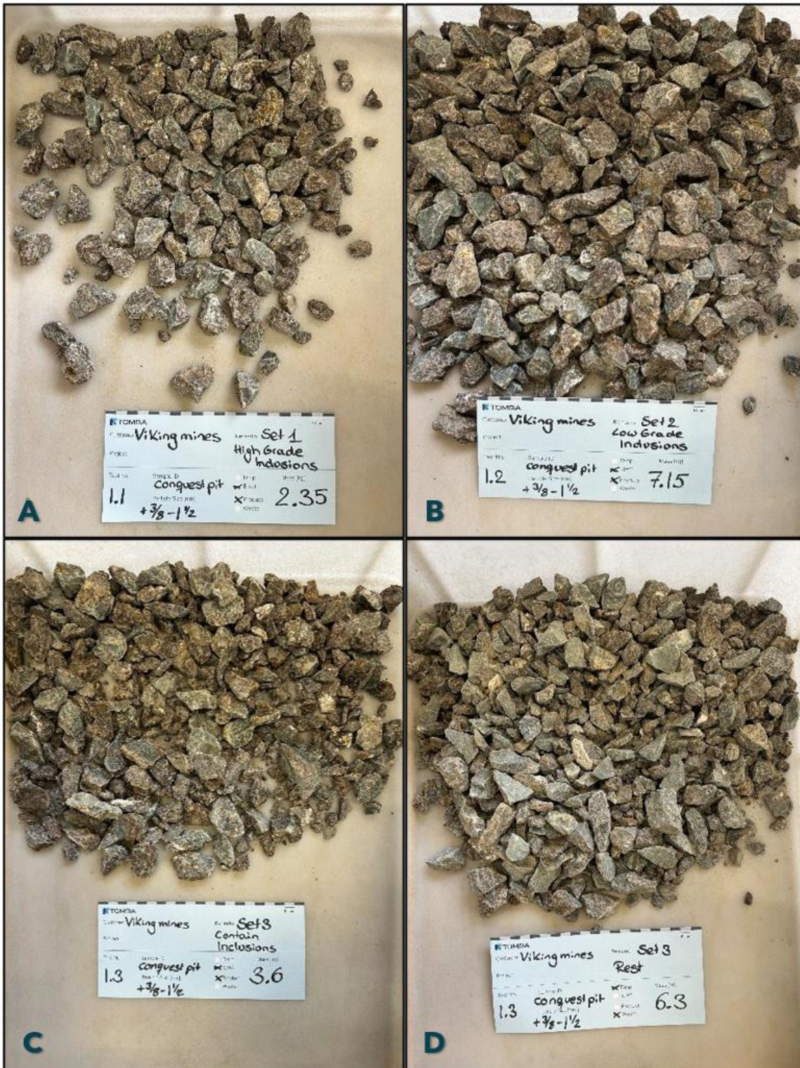
Figure 2; TOMRA XRT sorted fractions from the Conquest Pit sample: A: Set 1 High Grade Inclusions, B: Set 2 Low Grade Inclusions, C: Set 3 CONTAIN™ Inclusions and D: Waste (clockwise from top left).

For the Conquest Pit sample, approximately 68% of feed mass reported to the three product streams, with the balance rejected as waste (Figure 2). Visible scheelite was confirmed in the high-grade product fraction under ultraviolet (blacklight) illumination (Figure 1). For the Linka Stockpile sample, approximately 56% of feed mass reported to product streams (Figure 3). Product fraction assays have not yet been completed; TOMRA does not assay sorted fractions in order to retain independence, and the fractions have been returned to the Company's metallurgical laboratory in Canada for analysis, with results expected in the second half of July 2026.