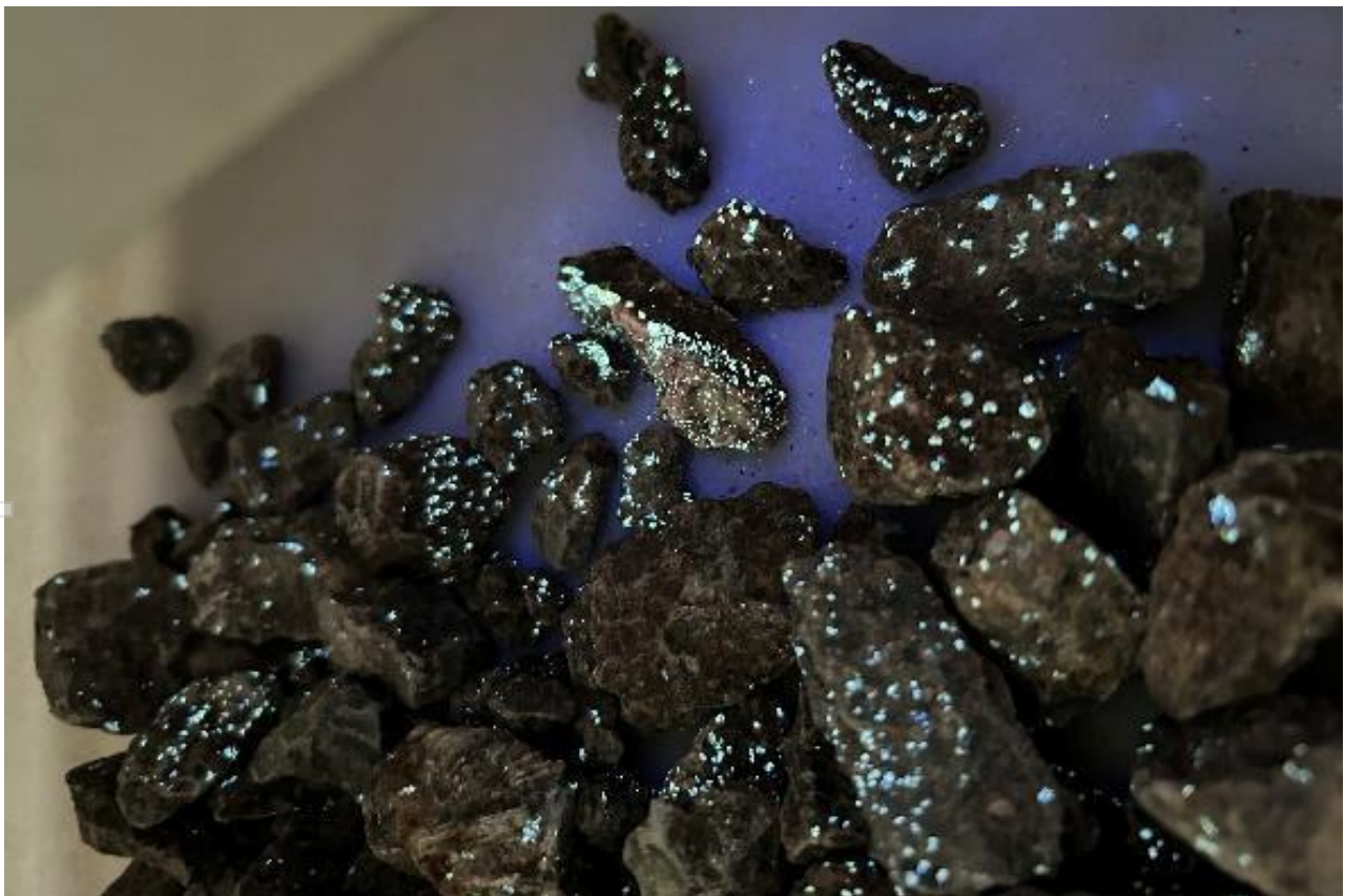
Figure 1; High-grade sorted fraction (Set 1) from the Conquest Pit sample under ultraviolet light, showing characteristic blue-white fluorescence of scheelite. Visual estimate containing between ~1.5% to ~3.5% scheelite (~1.2% to ~2.8% WO_3 ). Refer to Appendix 1. Assay results expected late July 2026.

Cautionary Statement: Visual estimates of mineral presence should never be considered a proxy or substitute for laboratory analyses where concentrations or grades are the factor of principal economic interest. Visual estimates also potentially provide no information regarding impurities or deleterious physical properties relevant to valuations.