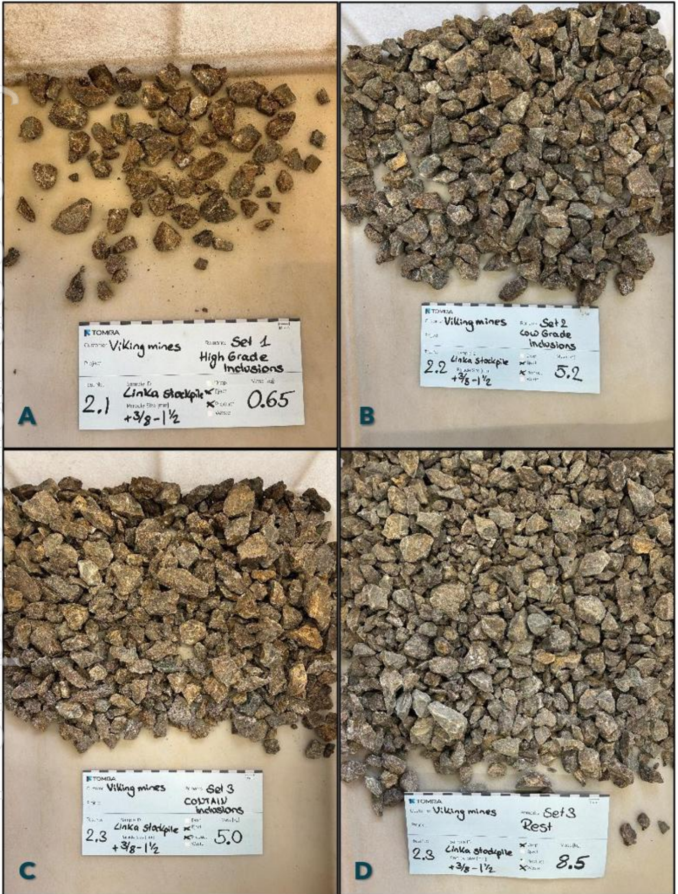
Figure 3; TOMRA XRT sorted fractions from the Linka Stockpile sample: A: Set 1 High Grade Inclusions, B: Set 2 Low Grade Inclusions, C: Set 3 CONTAIN™ Inclusions and D: Waste (clockwise from top left).