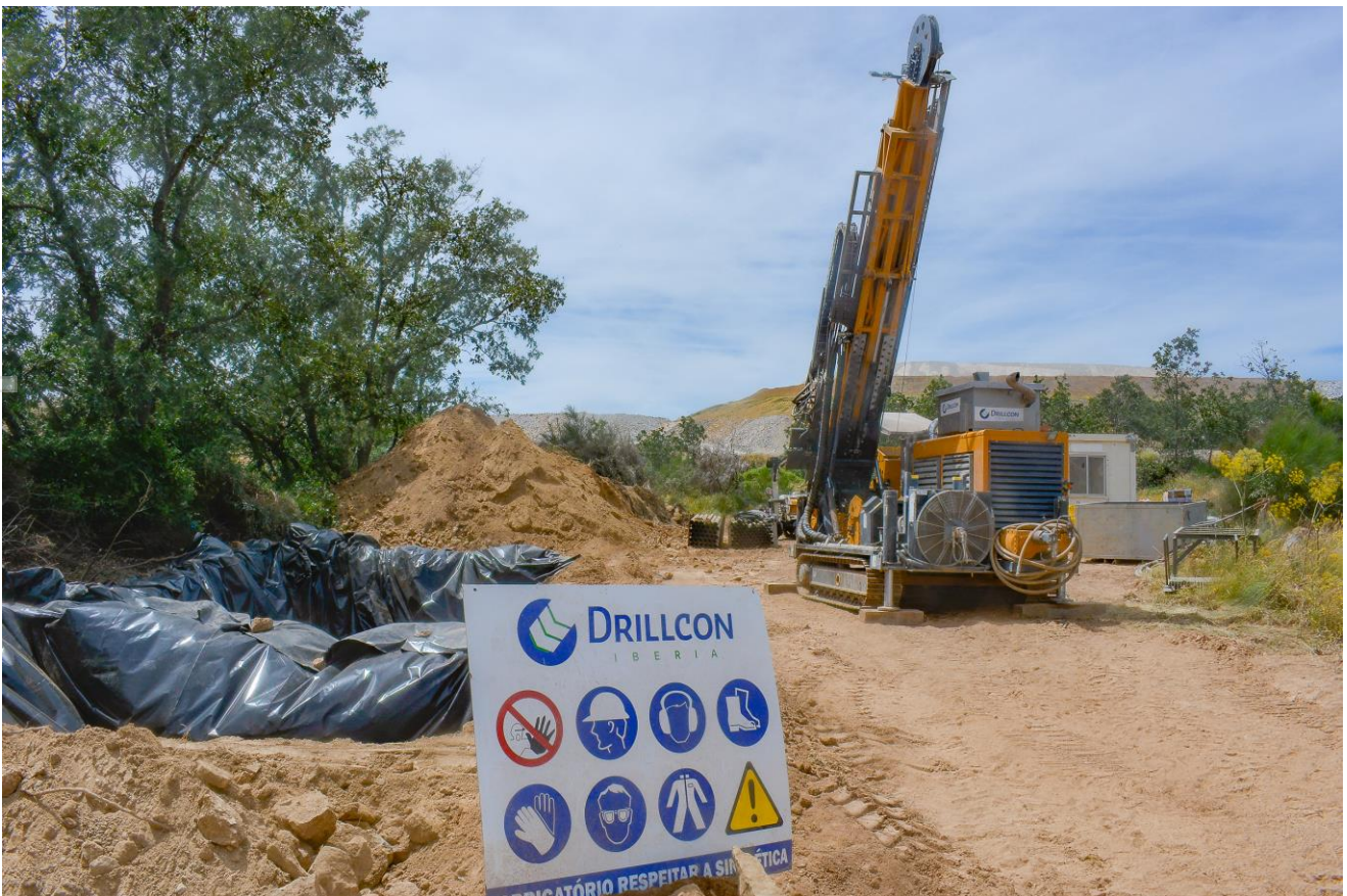
Figure 1: Drill rig on site at Barruecopardo Mine

“Barruecopardo remains open to the north, south and at depth, and this drilling program is an important step in testing that potential. The program is designed to extend mine life, improve understanding of the deeper zones planned to be mined and support the next phase of optimisation work at the operation.”