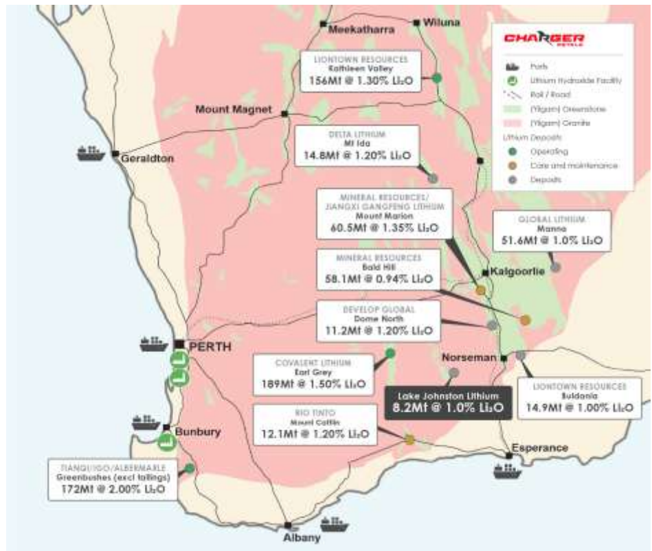
Figure 2. The Lake Johnston Lithium and Gold Project location in relation to other Yilgarn lithium plants, deposits and infrastructure.

Lithium prospects occur within a 50km long corridor along the southern and western margin of the Lake Johnston granite batholith. Key target areas include the Medcalf Spodumene Deposit and Medcalf West Prospect, the Mt Gordon Lithium Prospects and much of the Mount Day LCT pegmatite field, prospective for lithium and tantalum minerals.